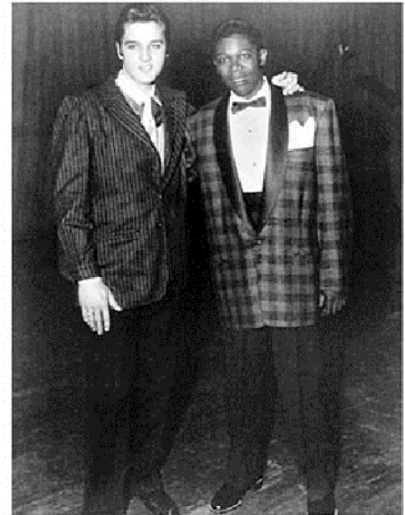
ERNEST C. WITHERS